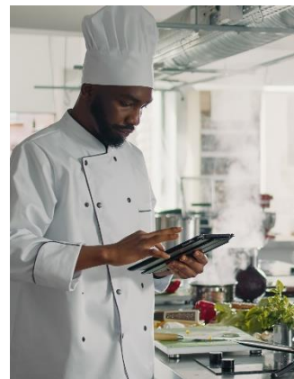
Food & Beverage